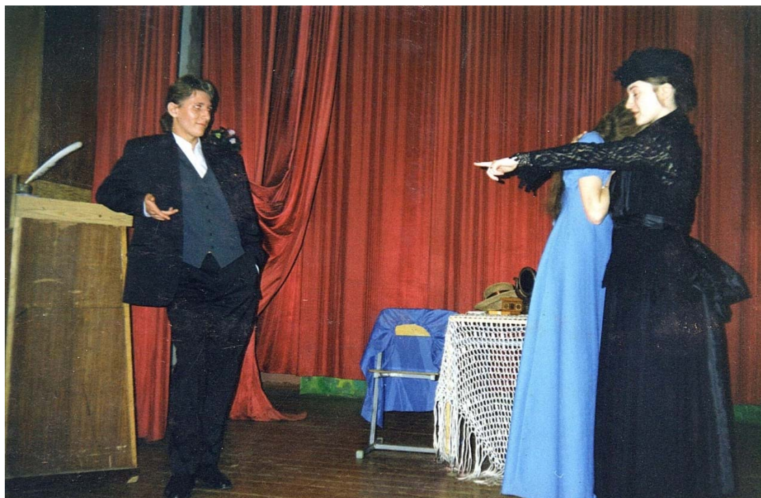
Image 4 – It's a Family Affair – We'll Settle It Ourselves . Source: Performed by students of grade 10, May 1999. Rehearsal.