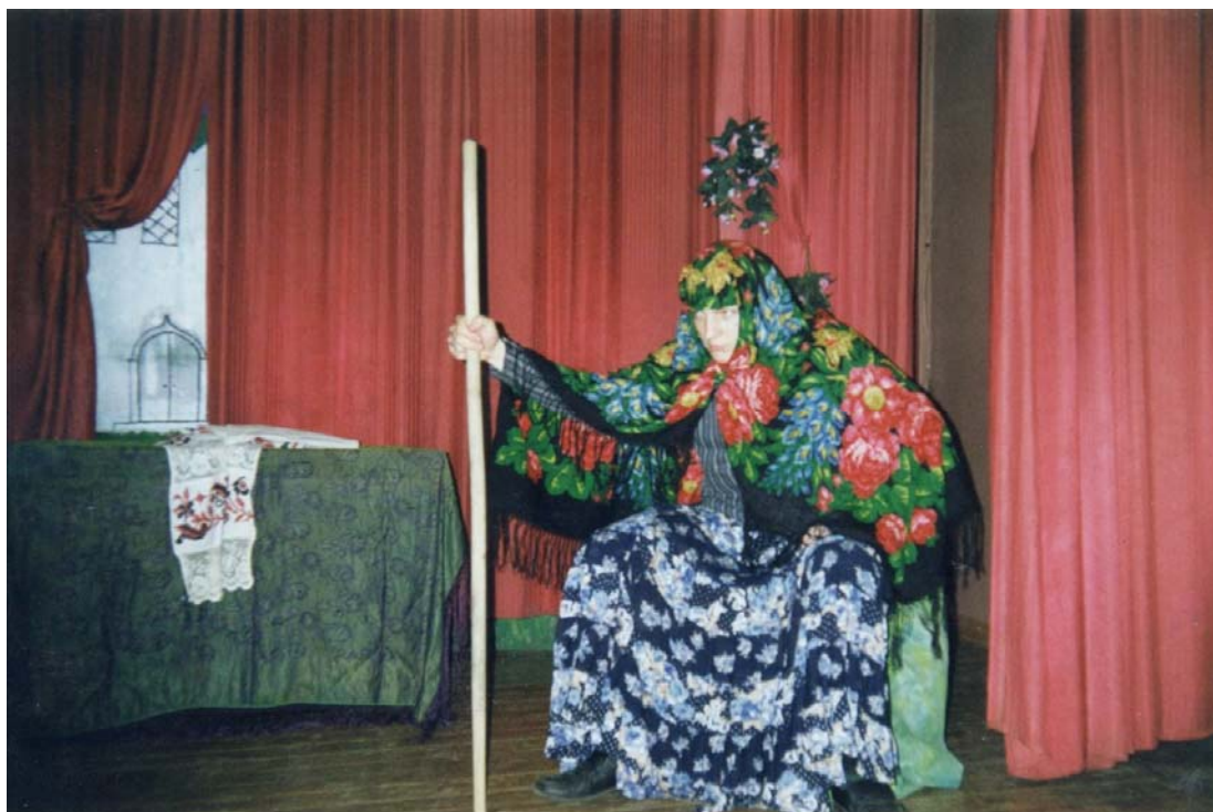
Image 8 – The Storm . Source: Performed by students of grade 10, May 1999. Rehearsal.

Another valuable annual project since the 1990s has been the Literary Lounge dedicated to the Silver Age of Russian Poetry (from the end of the 19 th to the beginning of the 20 th century). Within its scope, students select poetry, music, and songs from that period and perform them in the Literary Lounge. Marina Tsvetaeva, Anna Achmatova, Sergey Esenin, Nikolay Gumilyov, Alexander Block, Osip Mandelshtam, Igor Severyanin, Sinaida Gippius, Dmitry Merezhkovsky, and Vladimir Mayakovsky are some of the people whose poetry has been heard on the school's stage. The term Silver Age dates back to the 1890s-1920s, to the intensive intellectual period in philosophy and literature in Russia. This term neither refers to a specific chronological period, nor is it a number of literary movements. It reflects rather a special way of thinking. But this way of thinking referring to decadence was not popular in literature lessons in the 1970s in the Soviet Union 19 . As is well known, at that time Soviet ideology took priority. That is why common interest in poetry of the Silver Age as a national heritage was revived just a few decades later in the 1990s. So after students have chosen poems, learned them by heart, and presented them to the teacher, the latter starts to organize the order of the selected poems on stage in accordance with the individuality of every participating student. The aim is