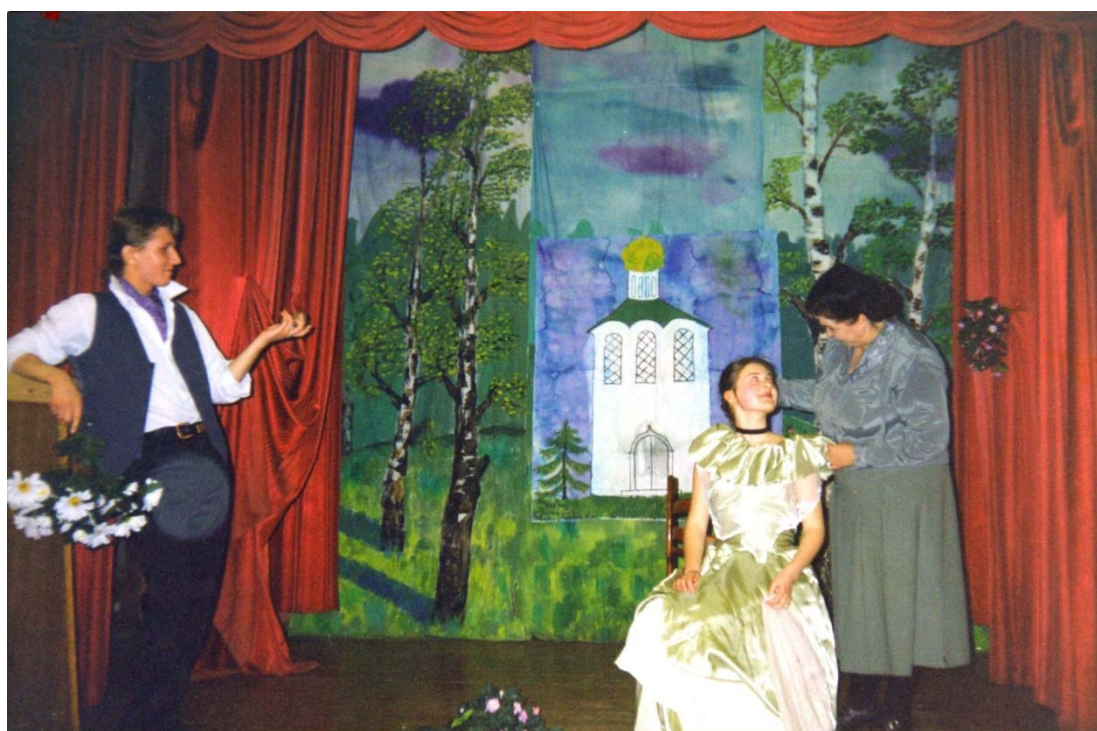
Image 1 – Without a Dowry . Source: Performed by students of grade 10, May 1999. Rehearsal. With the teacher of Russian language and Literature.