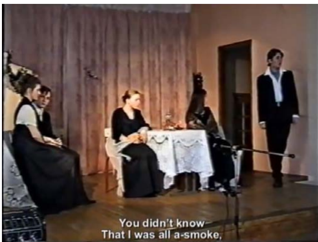
Video 5 – Literary Lounge, Poetry of The Silver Age , performed by students of grade 11, March 2000. Available at: < https://youtu.b=e/Wh9491VvwVU >.

to create logical connections and a specific social background 20 . Costumes are a personal decision of every participant. So clothes vary from severe long black dresses to colorful top hats and spoons in the buttonhole of the waistcoat. The latter variant is rather used to imitate a startling, provocative style, which was very popular among contemporaries of the Silver Age (artists themselves used a French word – épatage – for the effect they achieved with their looks).