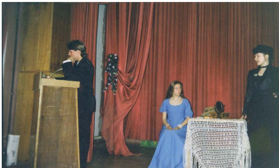
Image 5 – It's a Family Affair – We'll Settle It Ourselves . Source: Performed by students of grade 10, May 1999. Rehearsal.