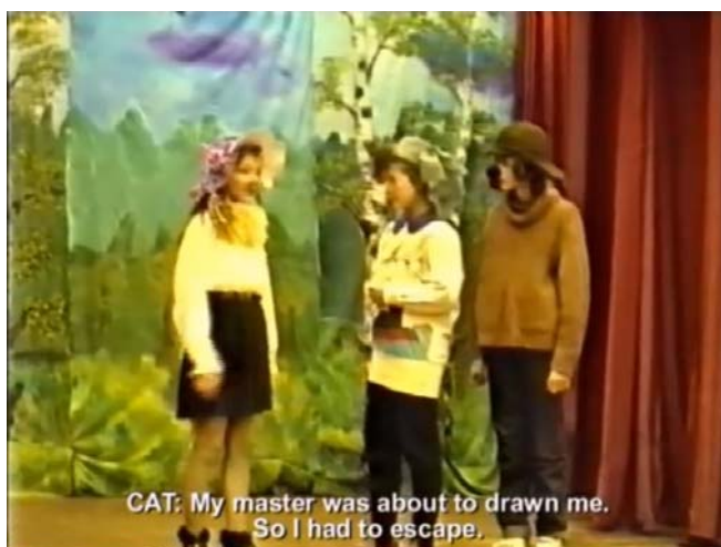
Video 1 – The Bremen Town Musicians . Source: Module Home Reading in German performed by students of grade 4, March 1993 16 . Available at: < https://youtu.be/28yPqCRA8KE >.

In comparison, Wilhelm Hauff's fairytale Nose, the Dwarf was staged by three different generations of students. Grade-6 students created their own script, initially in Russian, before it was translated into German. It was the first performance included in the competition Theatre Week for Children alongside Russian-speaking plays. Earlier, it was only Russian-speaking plays that were considered by the judges.