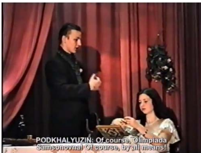
Video 4 – It's a Family Affair – We'll Settle It Ourselves performed by students of grade 10, May 1999. Available at: < https://youtu.be/mXmljWfNw_U >.