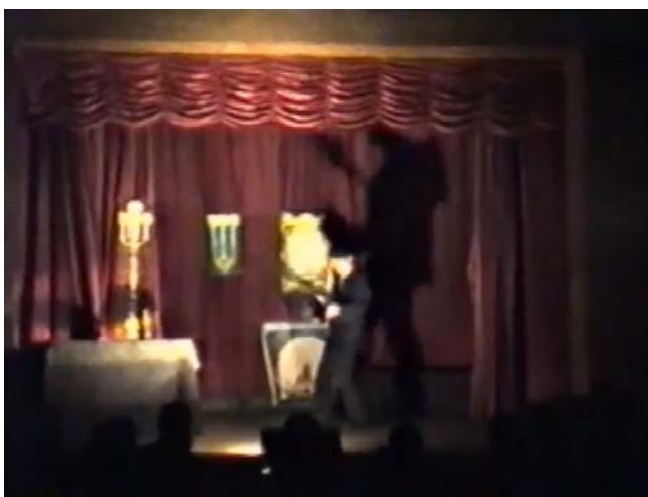
Video 3 – How He Lied to Her Husband . Source: Performed by students of grade 9, November 1993. Available at: < https://youtu.be/PQOGuwAH3P8 >.

George Bernard Shaw's How He Lied to Her Husband performed by students of grade 9 in 1993.