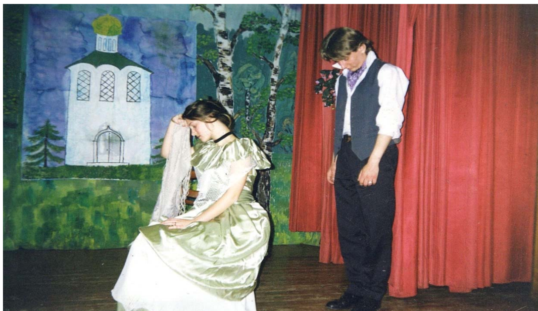
Image 2 – Without a Dowry . Source: performed by students of grade 10, May 1999. Rehearsal.