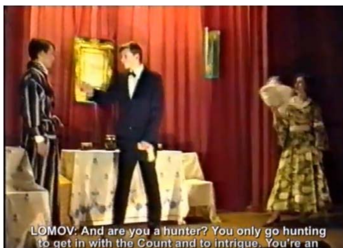
Video 7 – Theatre Week for Children, The Proposal by Anton P. Chekhov performed by students of grade 11, November 1995. Available at: < https://youtu.be/E-h9w9RLS0I >.