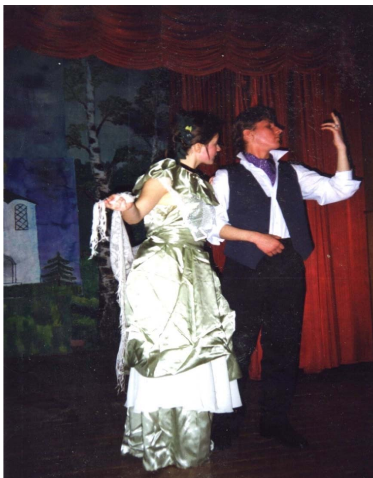
Image 3 – Without a Dowry . Source: Performed by students of grade 10, May 1999. Rehearsal.